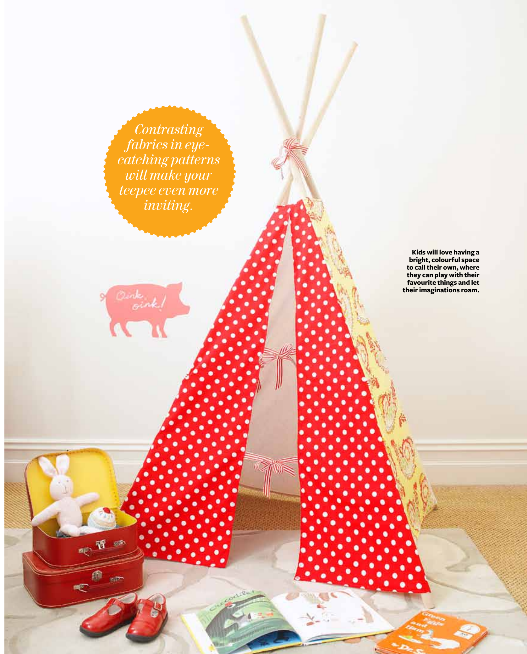
STYLING BY KELLY DOUST

Kids will love having a bright, colourful space to call their own, where they can play with their favourite things and let their imaginations roam.